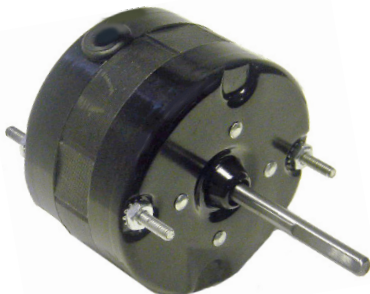
SS203 - SS206 - SS207