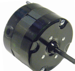
SS209 - SS214 - SS220