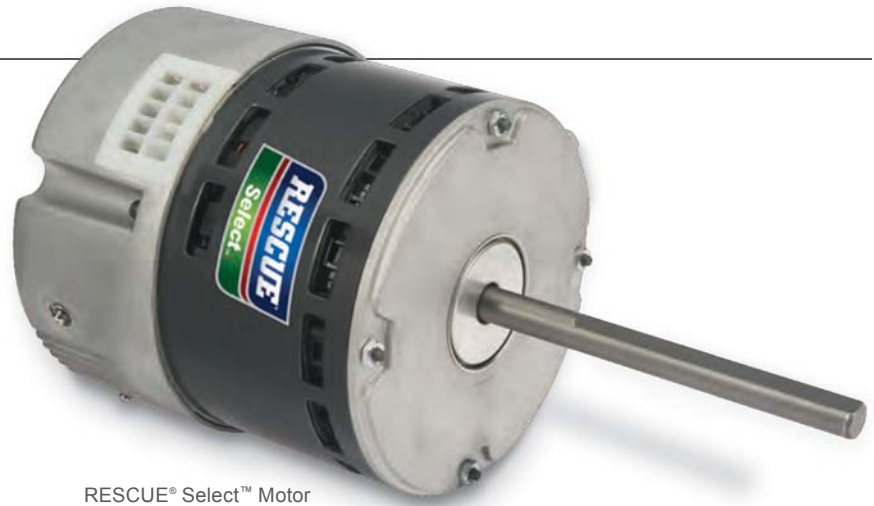
RESCUE® Select™ Motor