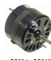
SS304 - SS319 SS305 - SS350 - SS409