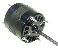
SS300 - SS356 - SS357