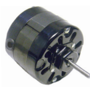
SS315 - SS355