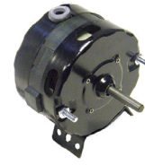
SS318 - SS326