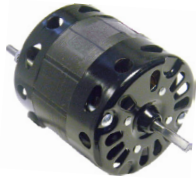
SS307 - SS313 - SS332 SS336 - SS360 - SS368