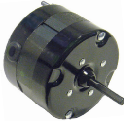
SS209 - SS214 - SS219 SS220 - SS235 - SS236 SS266 - SS801