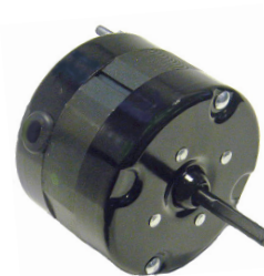
SS210 - SS217 - SS511