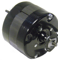
SS101 - SS103 - SS122 - SS137