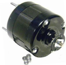
SS124 - SS125

Commercial Refrigeration, Condensers, Unit Coolers & Display Cases