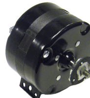
SS108 - SS123