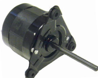
SS212S - MO-019