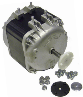
RMT0004 - RMT0005

OEM Replacement For Evaporator & Condenser Fans