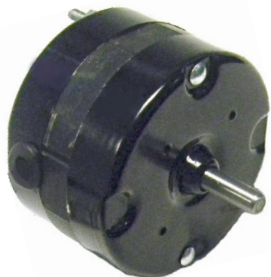
SS260 - SS262 - SS264 - SS266