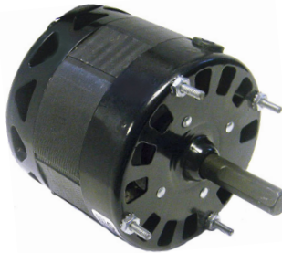
SS2603 - SS2604