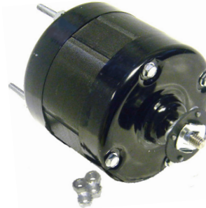
SS124 - SS125