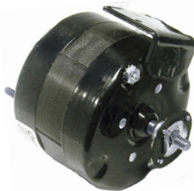
SS101L - SS103L