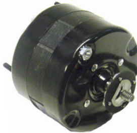
SS119 - SS120