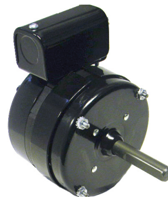
SS2609 - SS2612