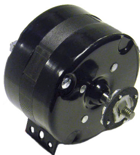
SS108 - SS123