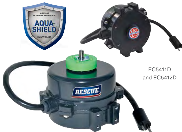
EC5411D and EC5412D