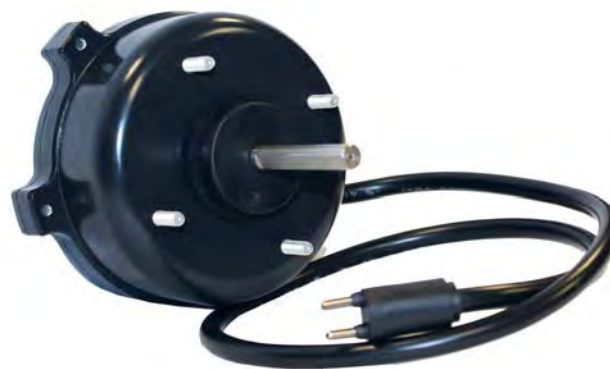
EC5404D and EC5405D