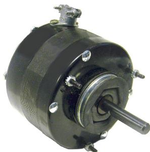
SS2615 - SS2360

Unit Heaters, Furnace Blowers, Refrigeration